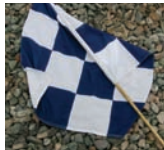
(on track circuit lines)